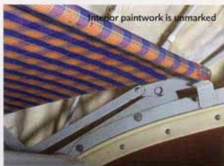
Interior paintwork is unmarked