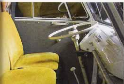
Under the original seat covers, the original VW seats are unmarked