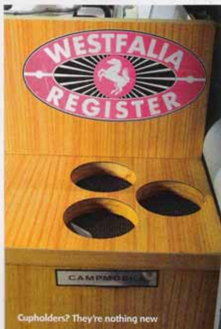
Cupholders? They're nothing new