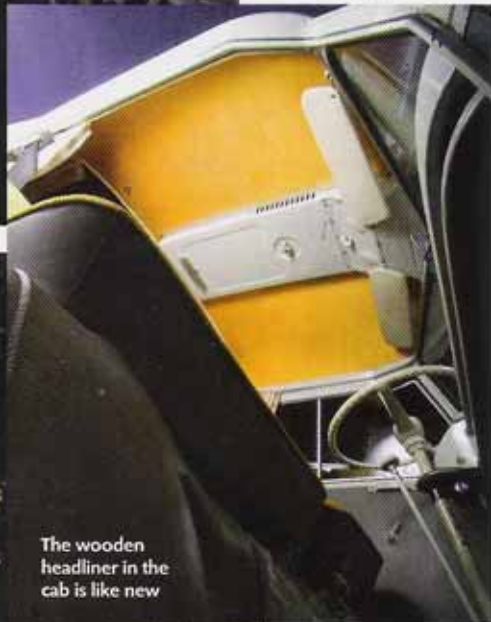
The wooden headliner in the cab is like new