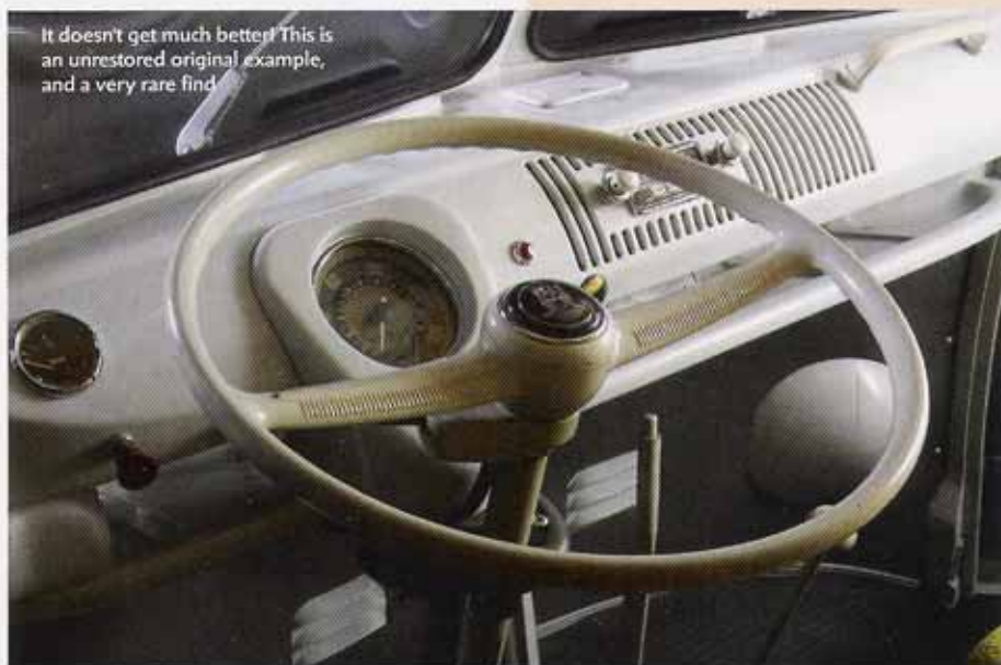
It doesn't get much better! This is an unrestored original example, and a very rare find.