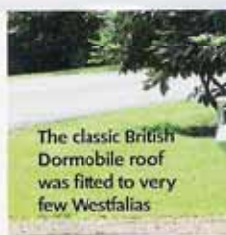
The classic British Dormobile roof was fitted to very few Westfalias

either. OK, it's not huge mileage, but neither has it been stored away in a barn somewhere, hidden from sight. This is just a well cared for old VW, which even came with its original small awning.