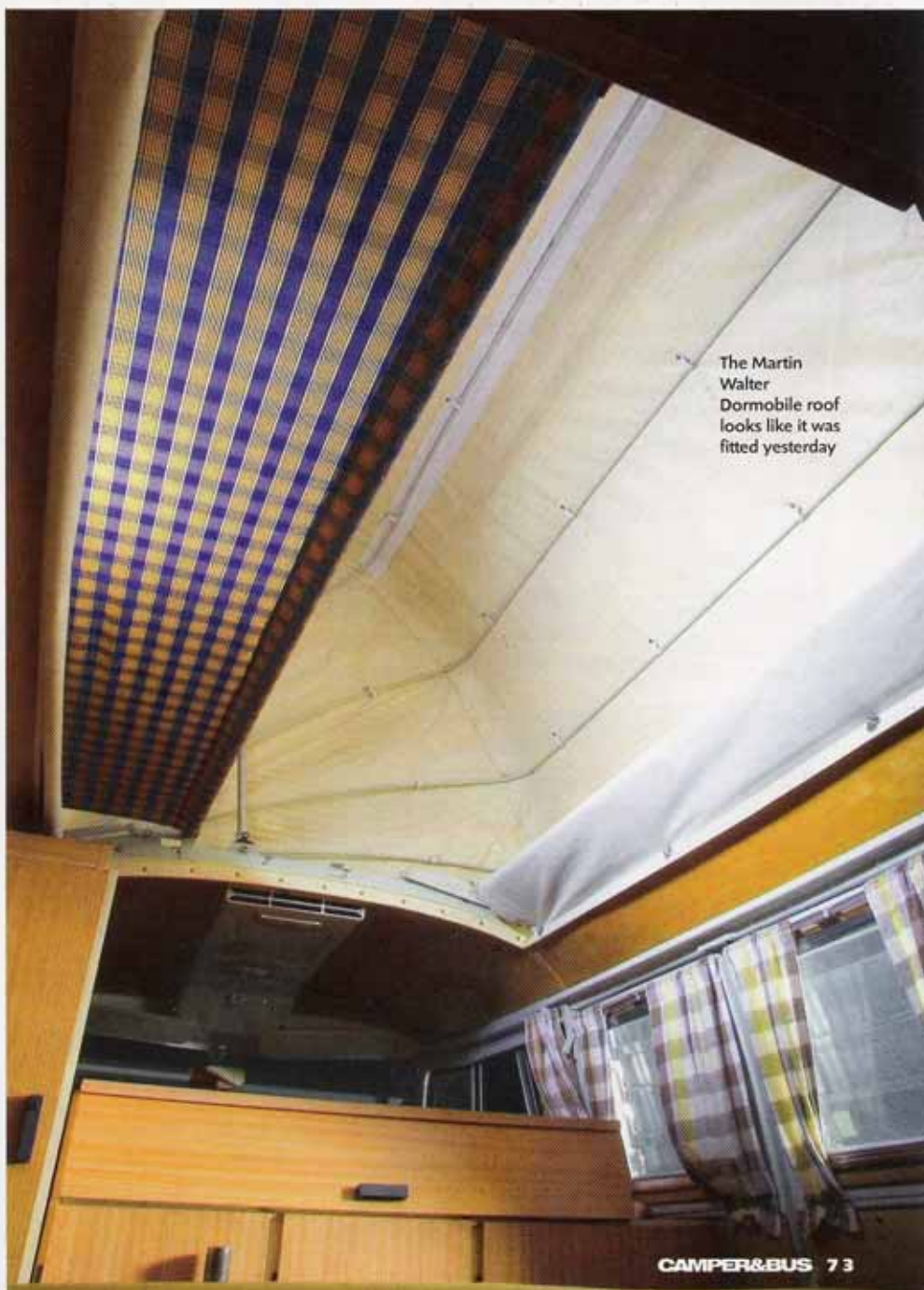
The Martin Walter Dormobile roof looks like it was fitted yesterday