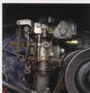
Pun alert: Unlike the owner, the original motor is not 'missing'